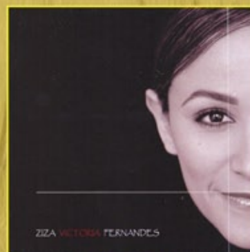
VICTORIA DZZ03 $150.00