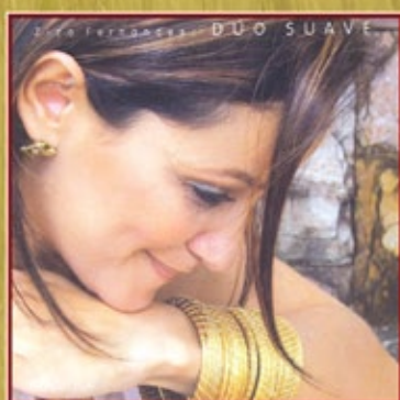
DÚO SUAVE DZZ04 $150.00