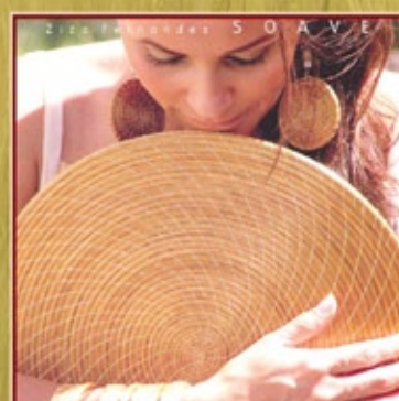
SOAVE DZZ06 $150.00