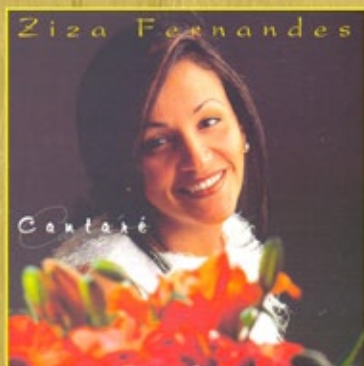
CANTARÉ DZZ01 $150.00